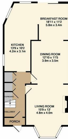
GROUND FLOOR APPROX. FLOOR AREA 716 SQ.FT. (66.5 SQ.M.)