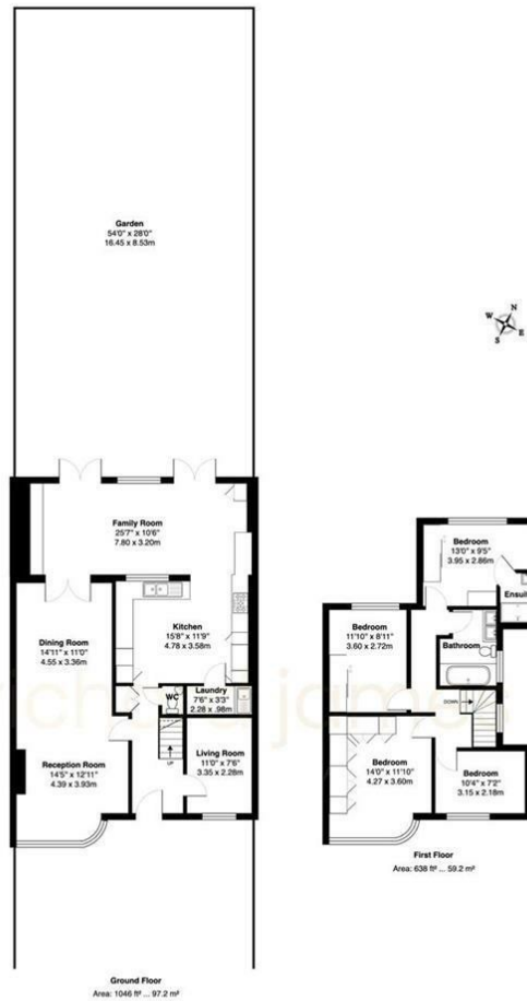
Ground Floor Area: 1046 sq ft ... 97.2 m 2