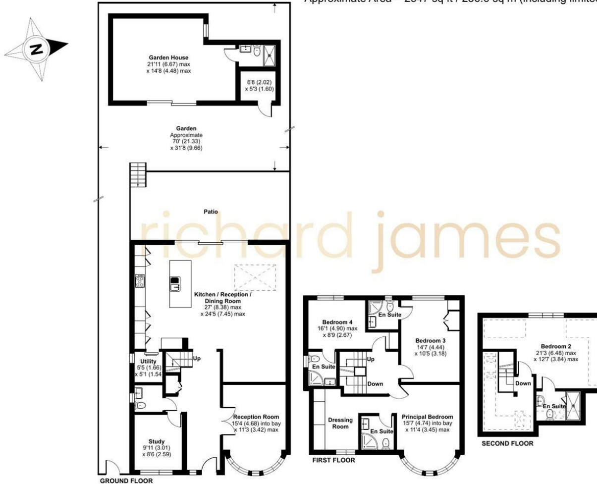
Floor plan produced in accordance with RICS Property Measurement 2nd Edition, incorporating International Property Measurement Standards (IPMS2 Residential). Produced for Richard James Estate Agents Ltd. REF: 1286118

As agents we have not tested any apparatus, equipment, fixtures, fittings or services, and so cannot verify that they are in working order or fit for the purpose. As a buyer you are advised to obtain verification from your Solicitor/Conveyancer or Surveyor, if there are any points of particular importance to you. Reference to the tenure of the property is based on information given to us by the seller, as we will not have had sight of the title documents. You are advised to obtain verification from your Solicitor/Conveyancer. Before viewing a property, do please check with us as to its availability, and also request clarification or information on any points of particular interest to you, to save you any possible wasted journeys. Also, photographs are for illustration only and may depict items which are not for sale or included in the sale of the property. All sizes are approximate; all dimensions include wardrobe space where applicable. While we believe that the area of the property has been accurately calculated, any prospective buyer who considers this feature to be particularly important is strongly recommended to have the site measurements checked by their own surveyor before submitting an offer to purchase.