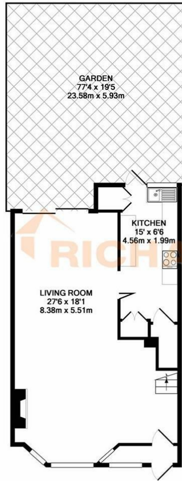
GROUND FLOOR APPROX. FLOOR AREA 516 SQ.FT. (47.9 SQ.M.)