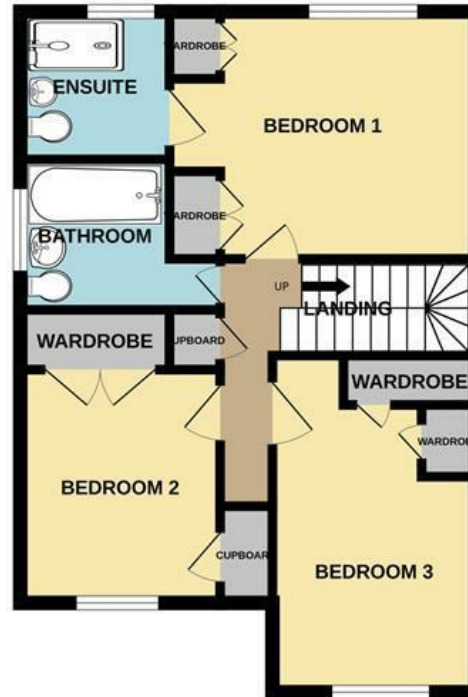
1ST FLOOR 467 sq.ft. (43.4 sq.m.) approx.