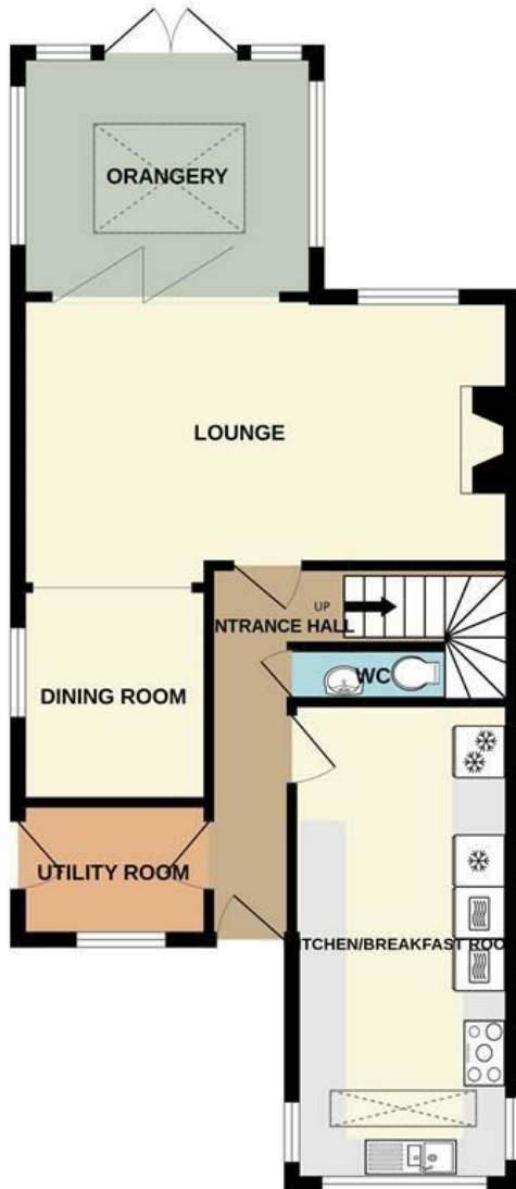
GROUND FLOOR 606 sq.ft. (56.3 sq.m.) approx.