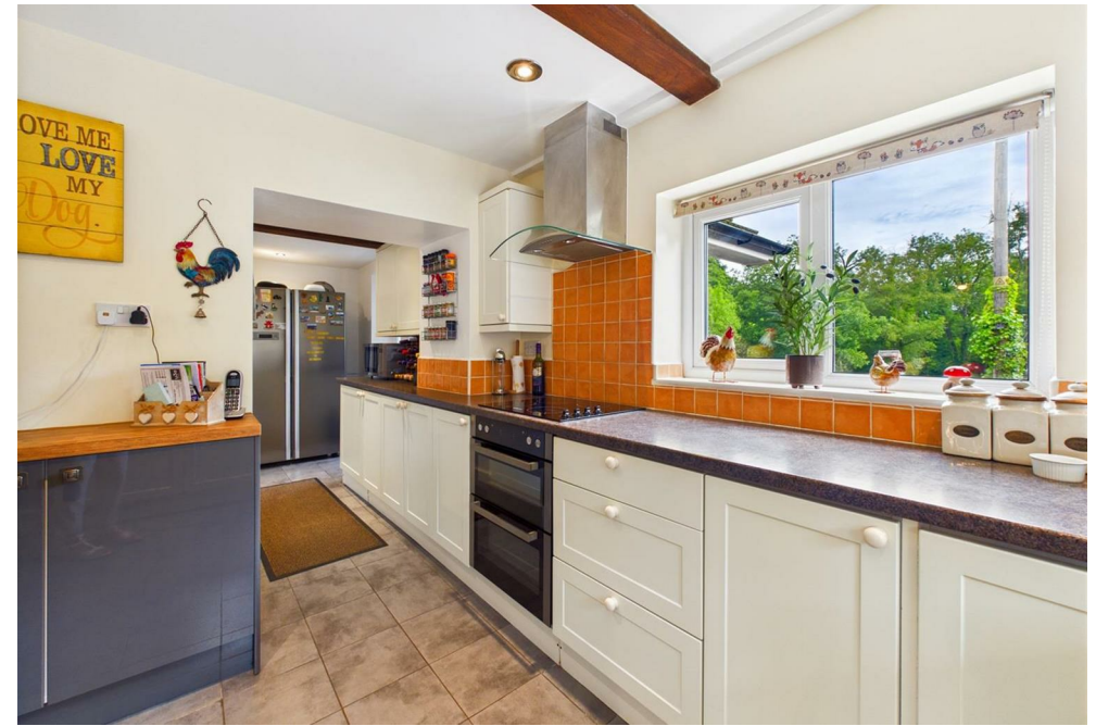
10 Hope Valley, Minsterley, Shrewsbury £465,000

This charming, detached cottage is set in extensive gardens and small adjoining paddock in all extending to approximately 1.45 acres or thereabouts. The property has been extensively renovated improved by the present owners, offering the following accommodation: entrance porch, sitting room, study, kitchen/ dining room, large utility room, downstairs WC. Upstairs there are three good sized bedrooms and large family bathroom with separate shower cubicle. The Property has the benefit of oil fired heating, uPVC, double glazing throughout together with extensive off-road parking with further space to store caravan/motorhome and large timber constructed garage/workshop. Small paddock is situated adjacent to the garage providing further amenity space. The gardens are of generous size with numerous outside sitting areas, storage sheds, and two summer houses. There is even an adjoining small woodland area to bottom. This truly delightful cottage enjoys lovely, elevated views over wooden hillside and early inspection is highly recommended.