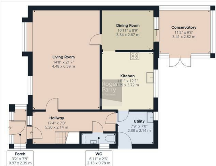
Ground floor Building 1