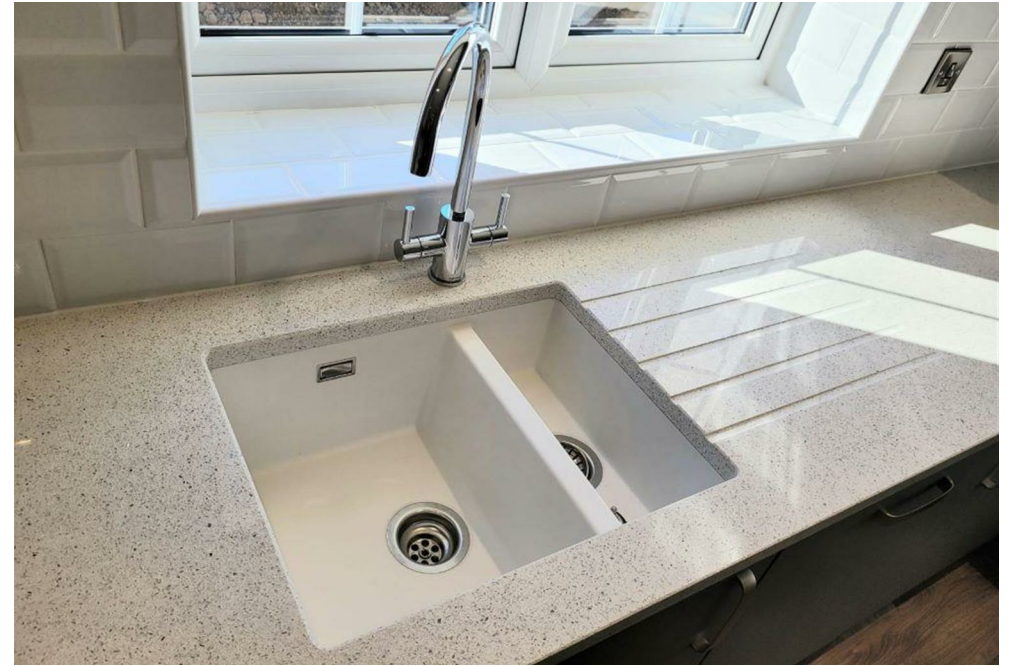
Plot 8 Maple Walk, Pont Robert, Meifod, SY22 6JB £400,000

Chestnut style is a 3-bedroom detached bungalow with a stunning conservatory. Accommodation comprises of: Reception hall, lounge, dining room, kitchen, utility room, conservatory bedroom 1 with en-suite, 2 further bedrooms, main bathroom. Completions: Estimated - Summer 2026.