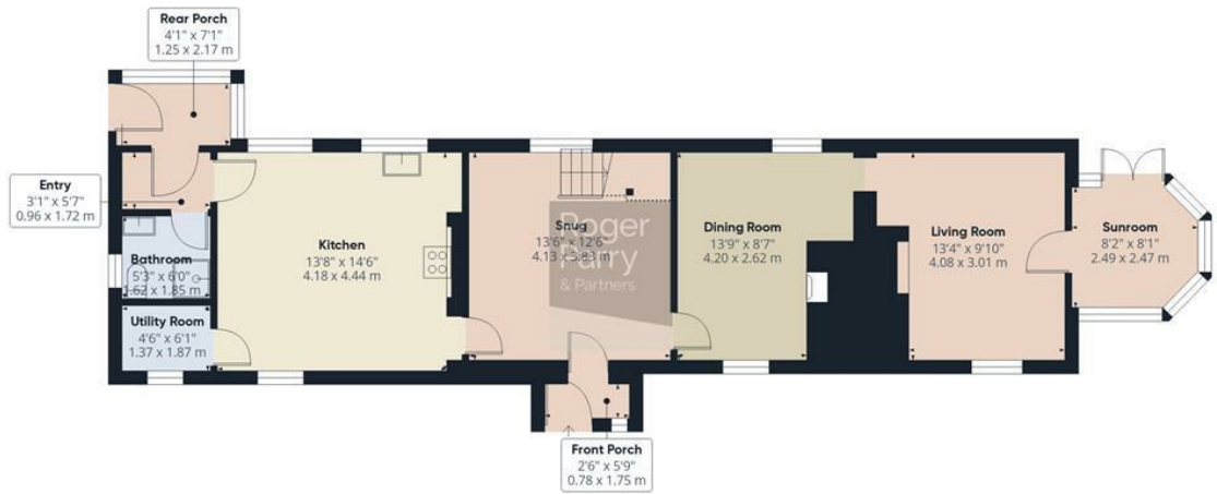
Ground floor Building 1