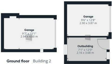
Ground floor Building 2