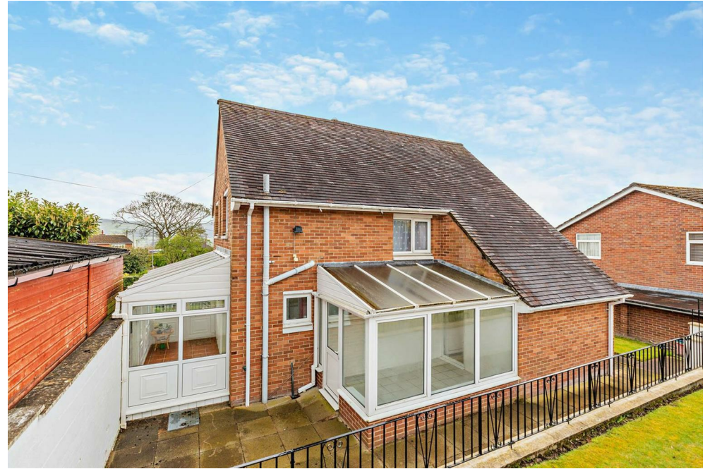
1 Trem Dyffryn, Red Bank, Welshpool, SY21 7PT £290,000

This spacious 3 bedroom, 2 reception detached house enjoys views towards countryside to the front and is situated within easy access of Welshpool town centre. Detached garage, off road parking and terraced gardens to the rear. NO ONWARD CHAIN.