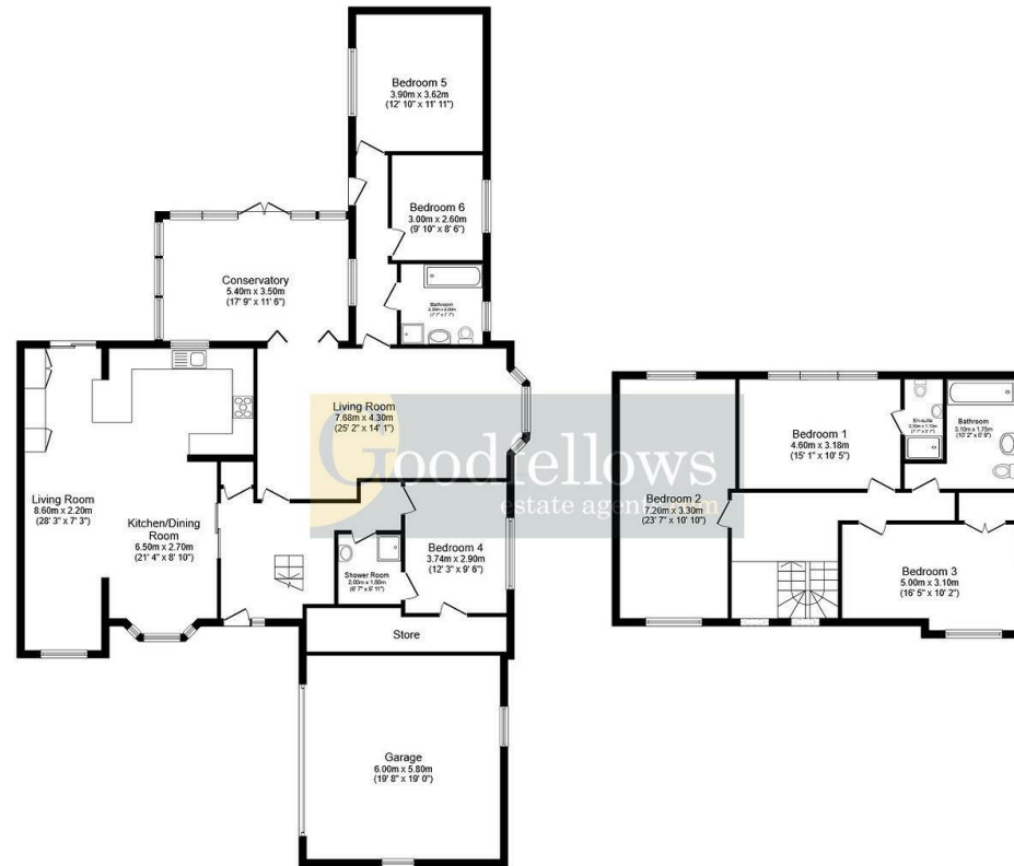
Ground Floor Floor area 201.6 sq.m. (2,170 sq.ft.)