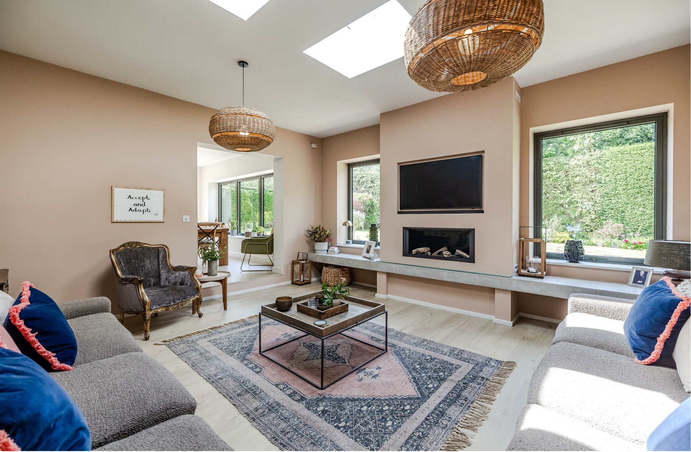
29 Willow Way, Darras Hall, Ponteland, NE20 9RF