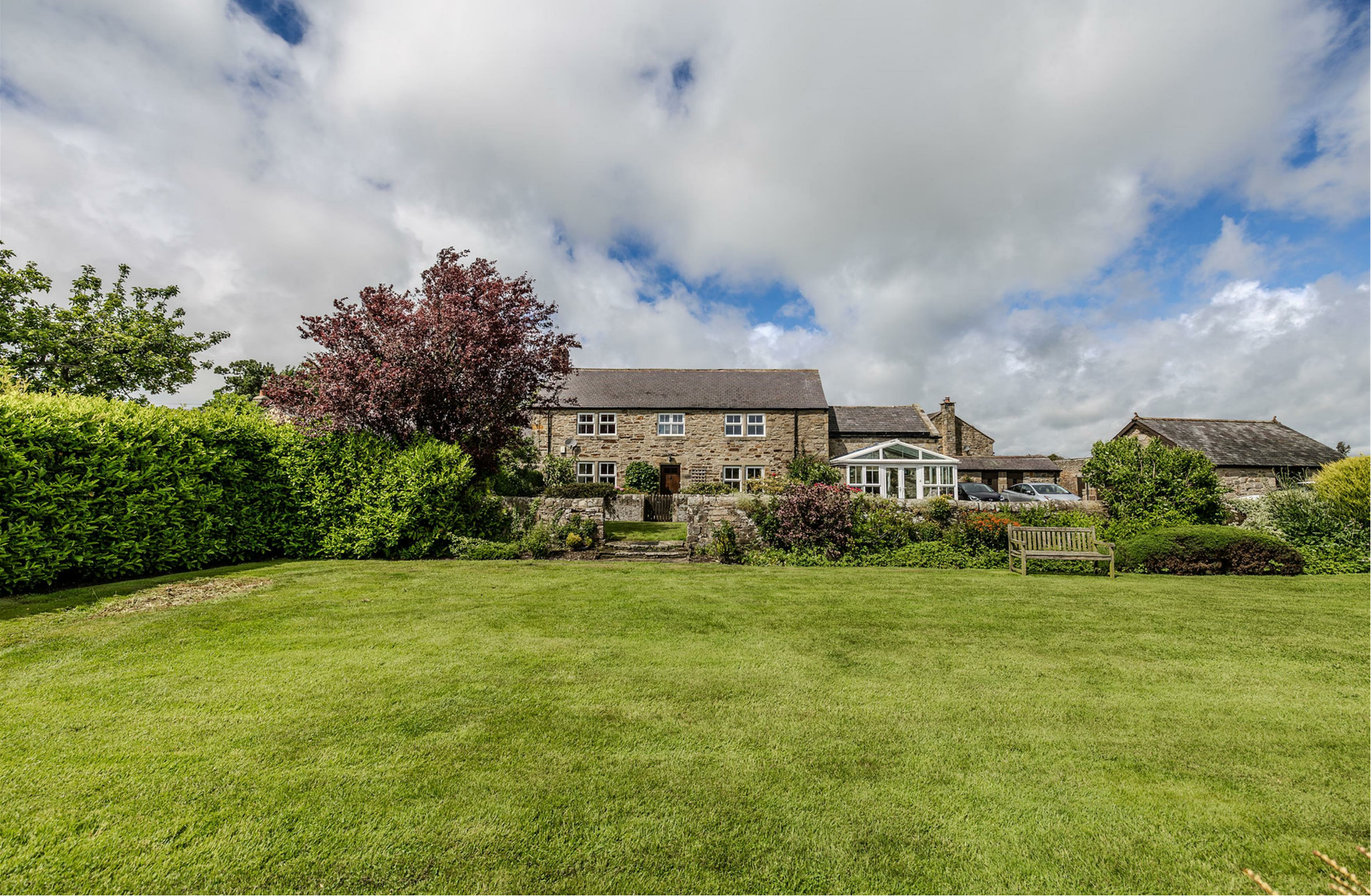
Robsheugh Farmhouse Robsheugh, Milbourne, Newcastle Upon Tyne, NE20 0JQ