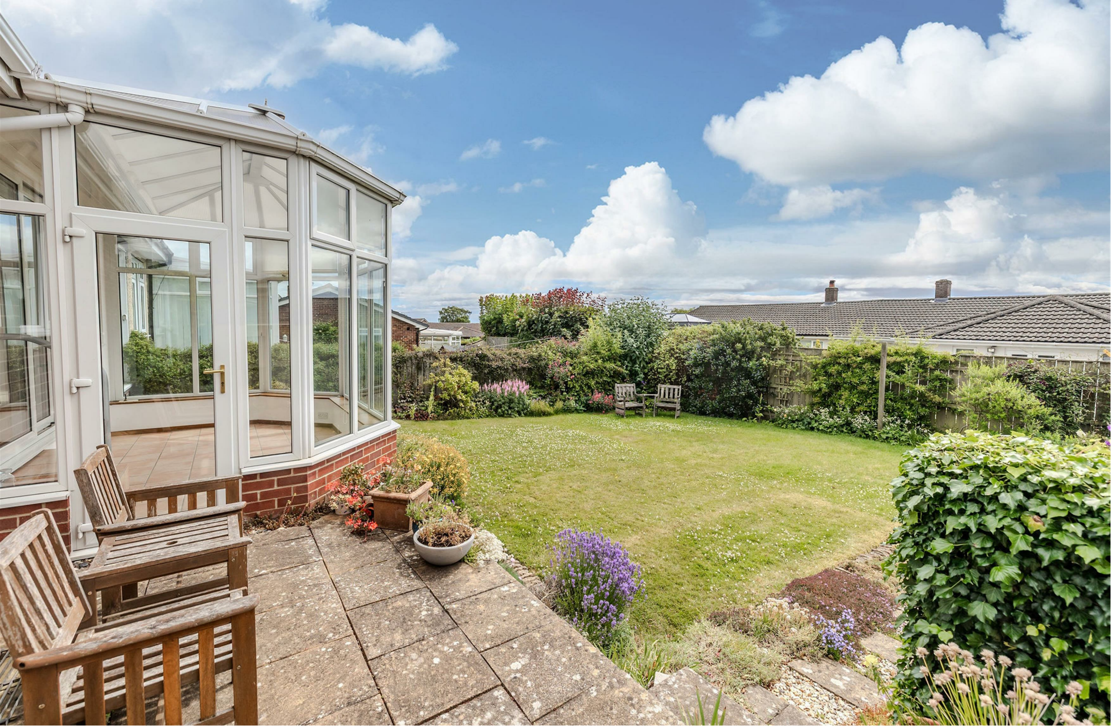
9 Trajan Walk, Heddon-On-The-Wall, NE15 0BL