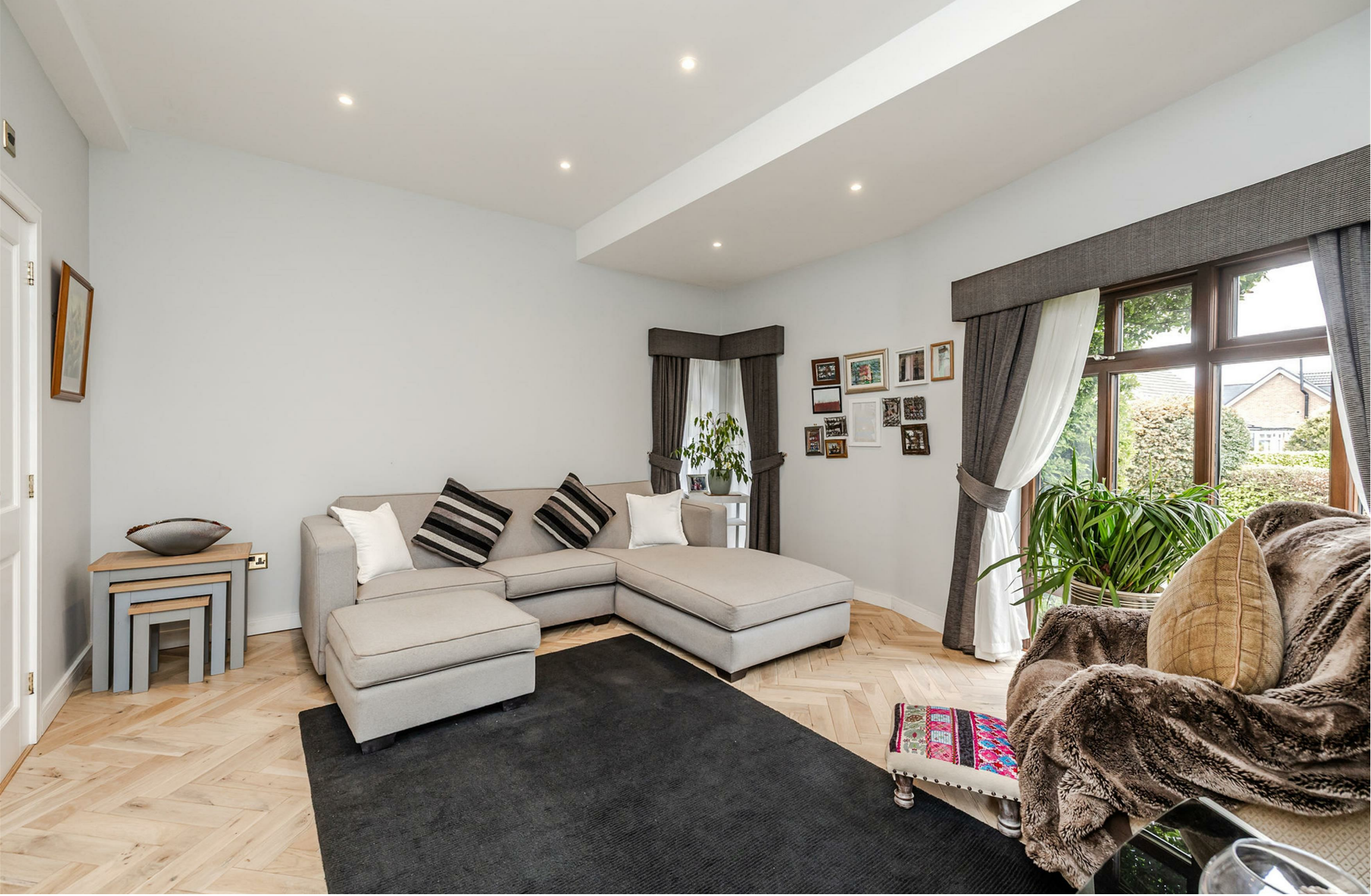
5 Meadow Court, Darras Hall, Ponteland, NE20 9RA