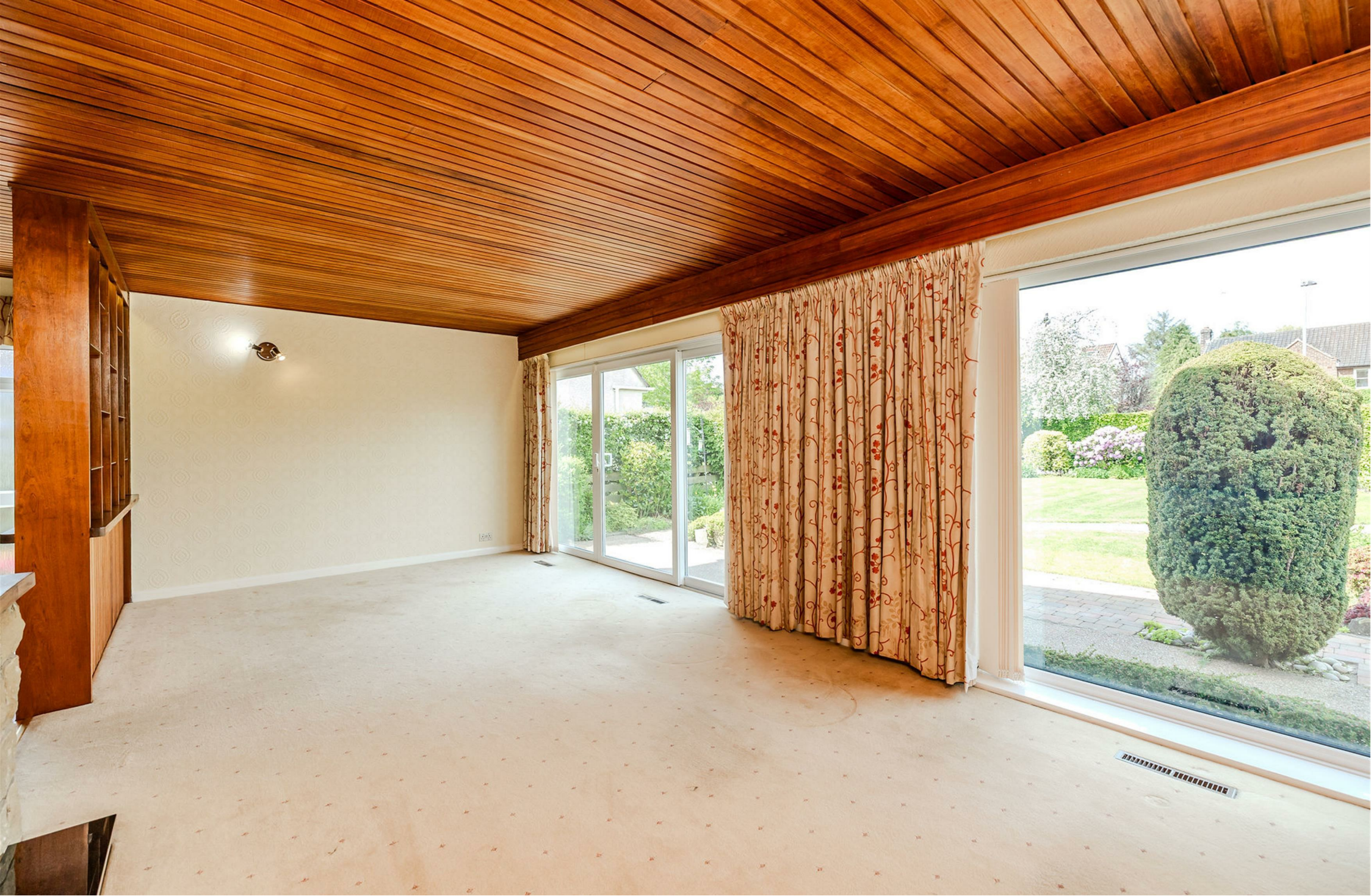
67A Eastern Way, Darras Hall, Ponteland, NE20 9RE