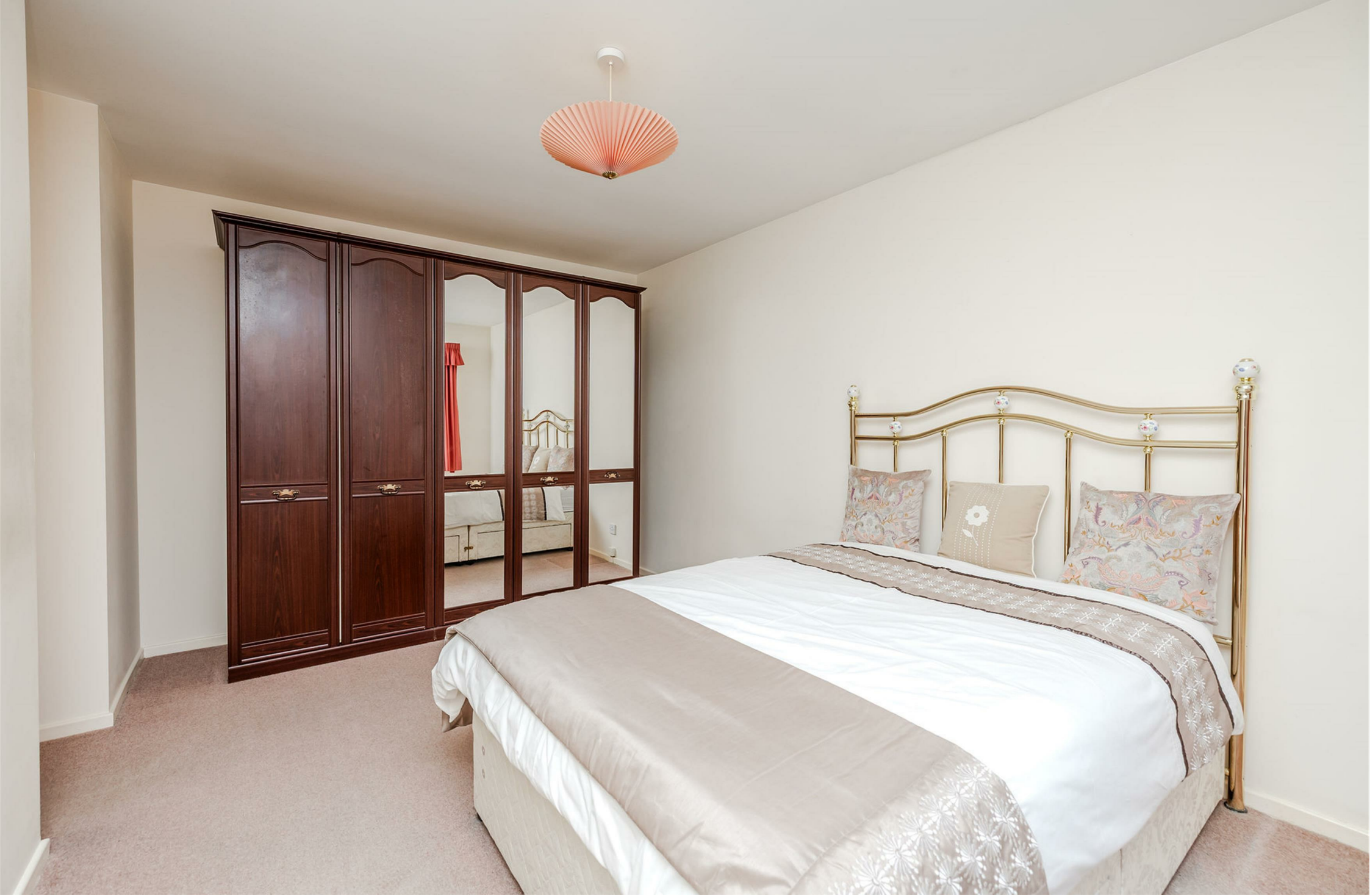
20 Old Station Court, Darras Hall, Ponteland, NE209NT