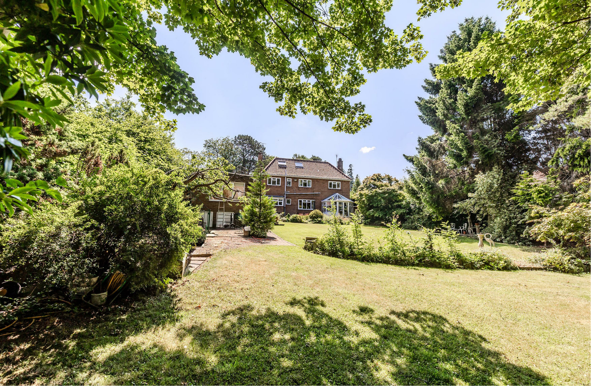
90 Runnymede Road, Darras Hall, Ponteland, NE20 9HH