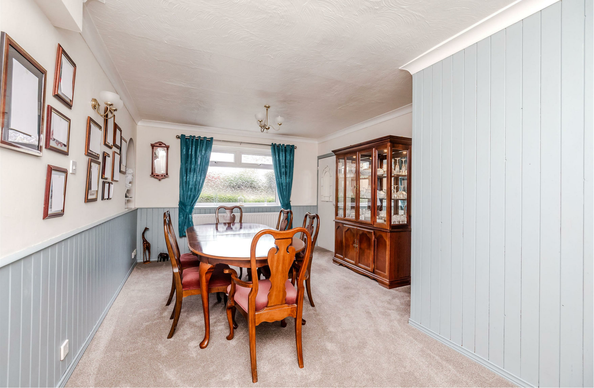
2 Morston Drive, Dumping Hall, Newcastle Upon Tyne, NE15 7RZ