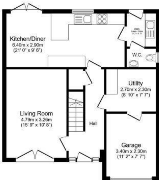
Ground Floor Floor area 65.9 sq.m. (709 sq.ft.)