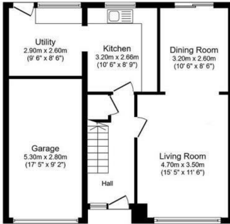
Ground Floor Floor area 65.9 sq.m. (709 sq.ft.)