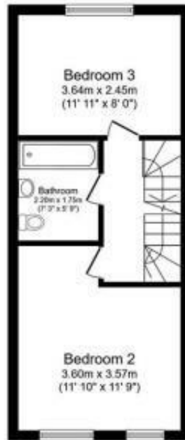
First Floor Floor area 32.4 sq.m. (349 sq.ft.)