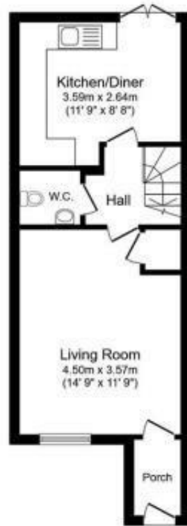
Ground Floor Floor area 34.3 sq.m. (369 sq.ft.)