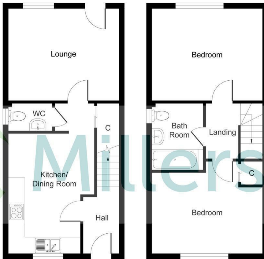
Ground Floor (Plot 5)