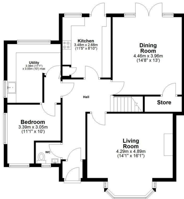
Ground Floor Approx. 84.0 sq. metres (904.1 sq. feet)