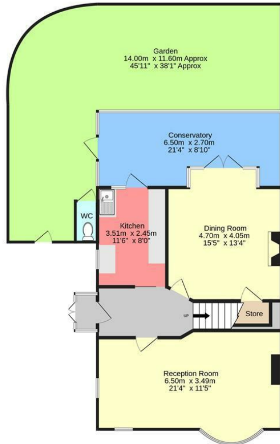
GROUND FLOOR 75.1 sq.m. (809 sq.ft.) approx.